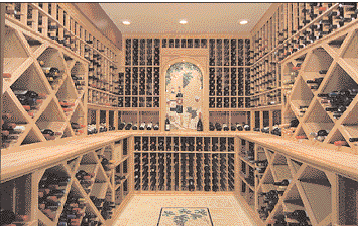
A lighted arch with arresting artwork is the focal point of this wine cellar.