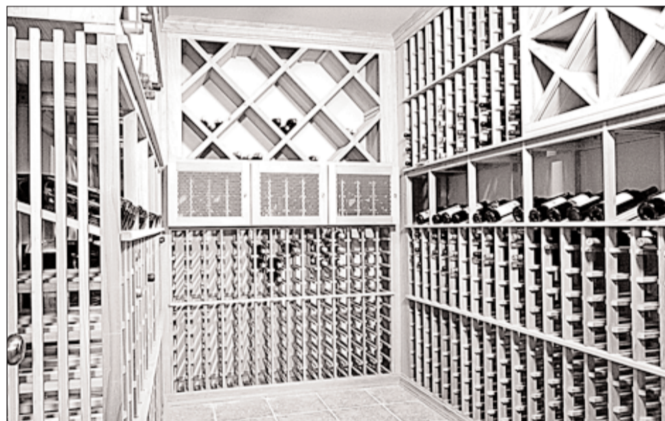
Redwood can be a good finishing material for a humid wine cellar because it resists deterioration.

Cellar owners who want to get fancy have all kinds of options. Floors and countertops can be made with wood from vintage wine barrels, complete with cooperage stamps. Waterfalls not only look dramatic, but also help keep up the humidity in the room. Racks to display special vintages can be