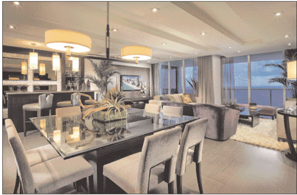
Model Residence #1903 boasts a contemporary design punctuated with color and texture, with highlights including dark porcelain tile floors and wenge woodwork on the walls.