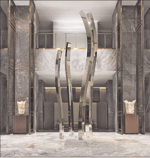
With innovative architecture and breathtaking design, Trump Hollywood was masterfully conceived and impeccably realized.